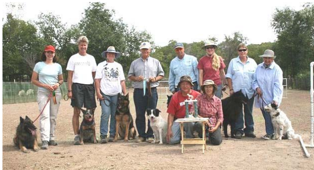
Shown here are folks who supported the Karen Paone Memorial Herding Trial which was held in October.