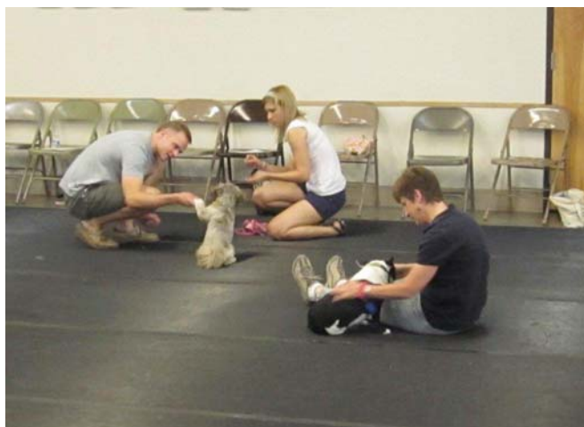
A scene from the Summer Tricks Class