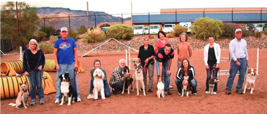
Agility Prep Class at their Graduation on October 4, 2011.

The Tricks Class held at SDOC in the summer was such a success that another class is being offered starting in December. Anyone can take the upcoming tricks class, and all new tricks will be taught in this class. The six-week course will be held on Saturdays at 10:30 a.m., and the dates for the class will be Dec. 3, 10, 17, then a two-week break for the Holidays and resuming for three more classes on January 7, 14, and 21. Come and join in for a class withat will be fun for you and your dog and where you can learn skills that can help yo in other dog sports. All those interested need to sign up as usual with the Registrar, including other instructors.